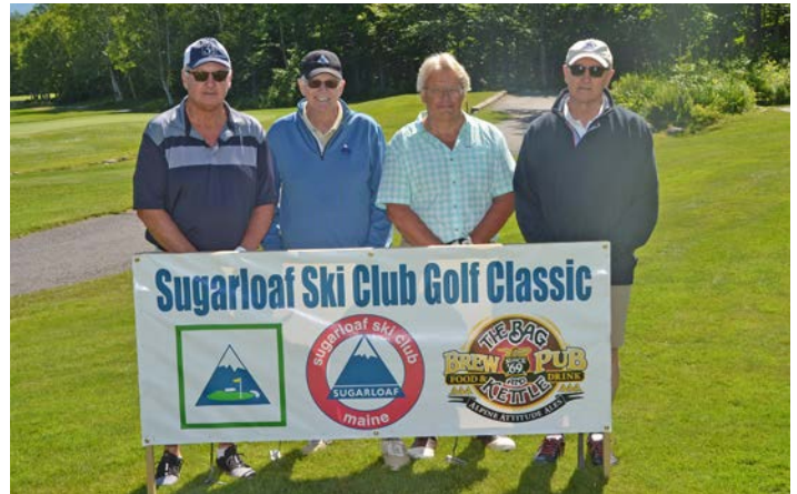
Anderson Insulation has been a loyal supporter of the Sugarloaf Ski Club Golf Classic.