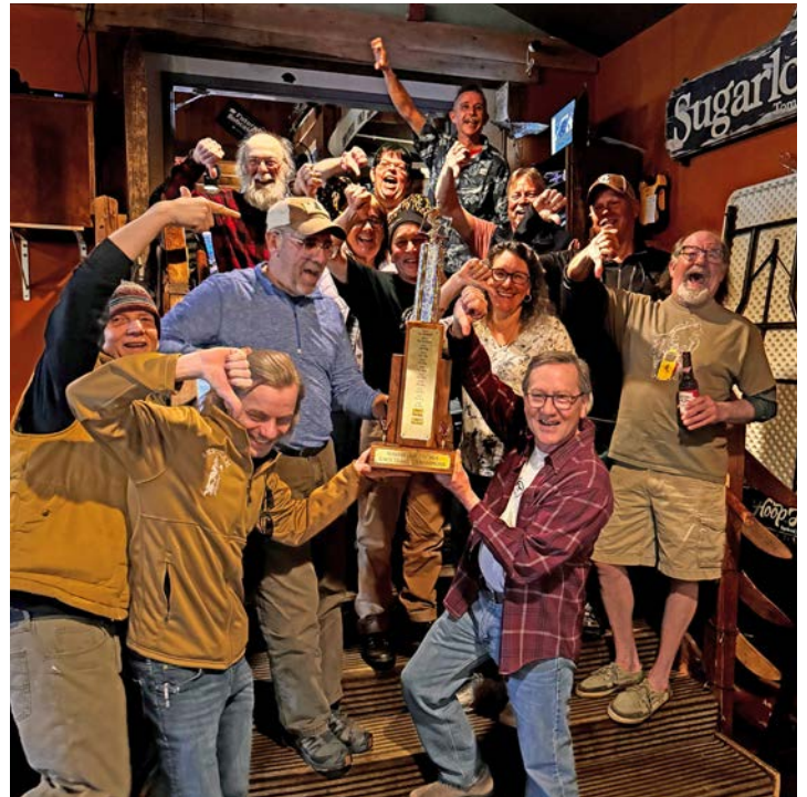
The Rack Locals Team