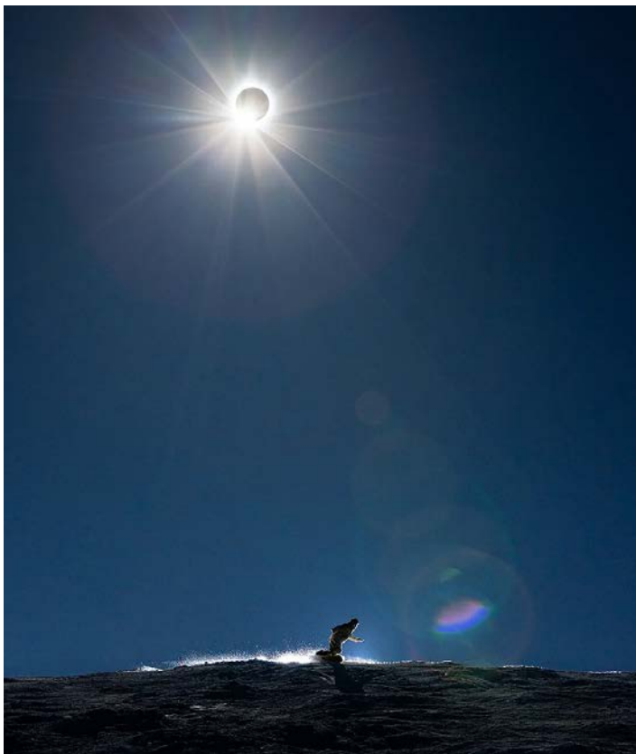
Photographer Jamie Walter captures a snowboarder beneath the total eclipse of April 8.