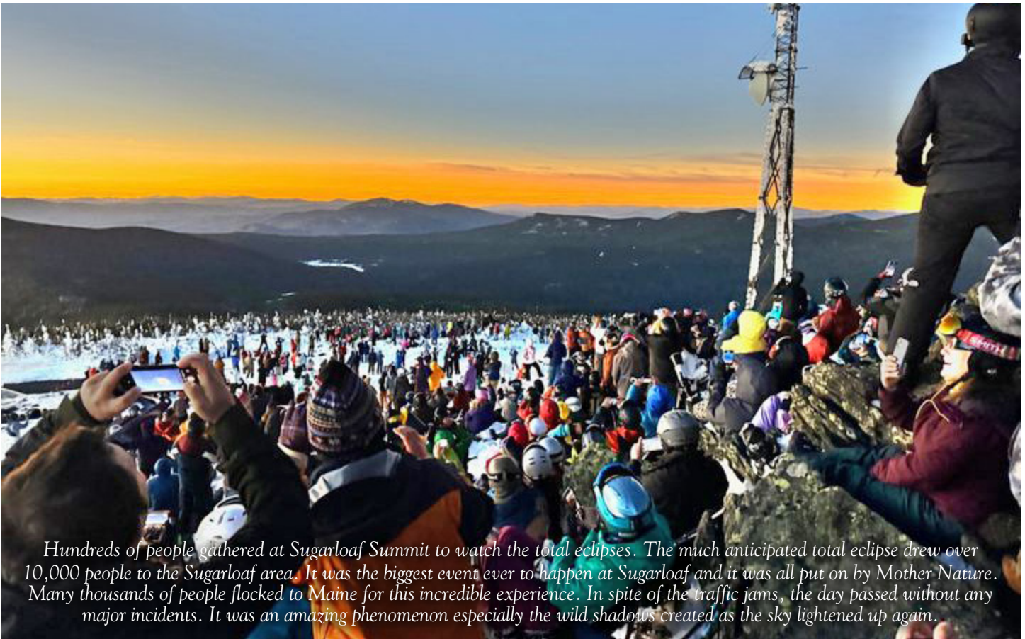
Hundreds of people gathered at Sugarloaf Summit to watch the total eclipses. The much anticipated total eclipse drew over 10,000 people to the Sugarloaf area. It was the biggest event ever to happen at Sugarloaf and it was all put on by Mother Nature. Many thousands of people flocked to Maine for this incredible experience. In spite of the traffic jams, the day passed without any major incidents. It was an amazing phenomenon especially the wild shadows created as the sky lightened up again.